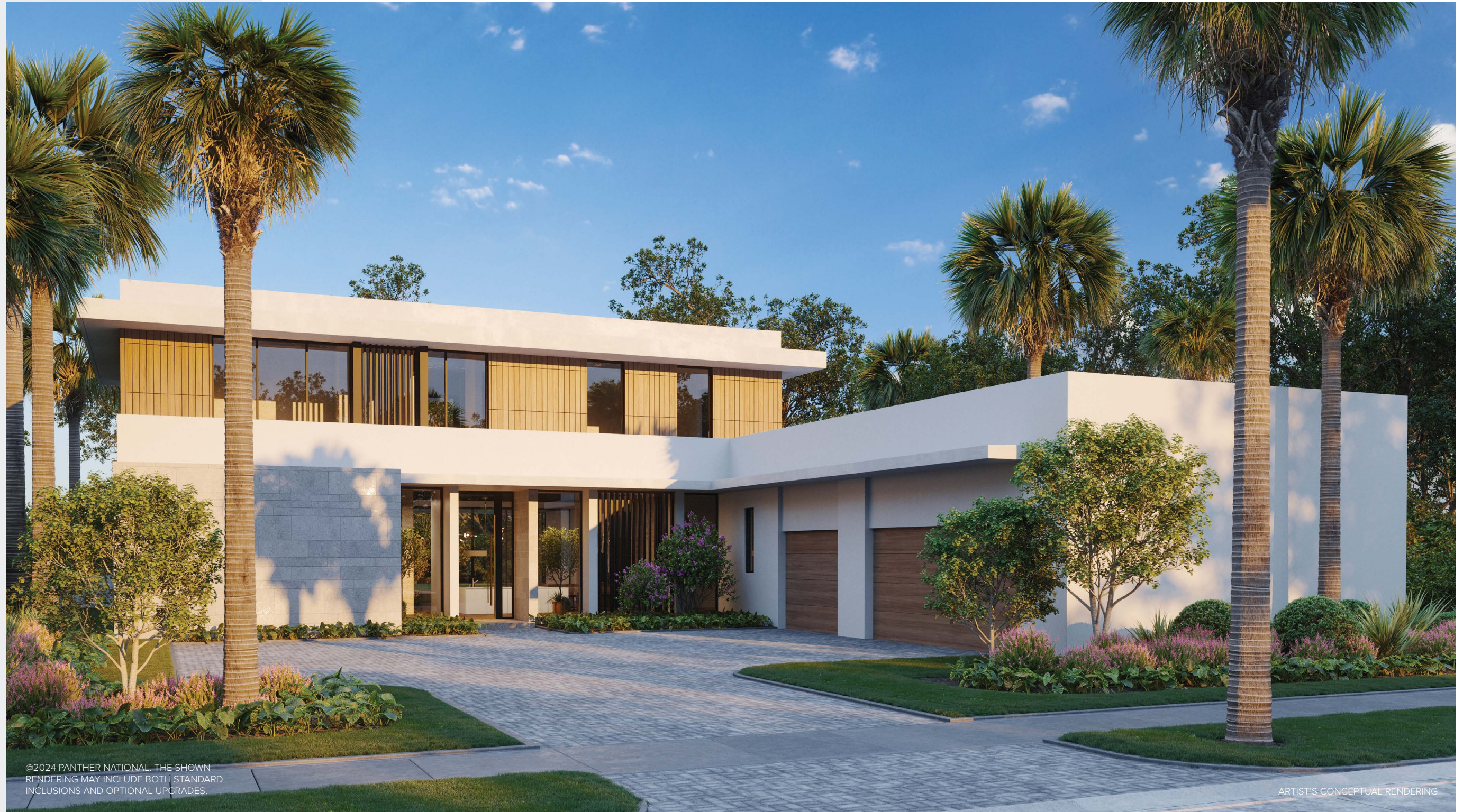
@2024 PANTHER NATIONAL. THE SHOWN RENDERING MAY INCLUDE BOTH STANDARD INCLUSIONS AND OPTIONAL UPGRADES.