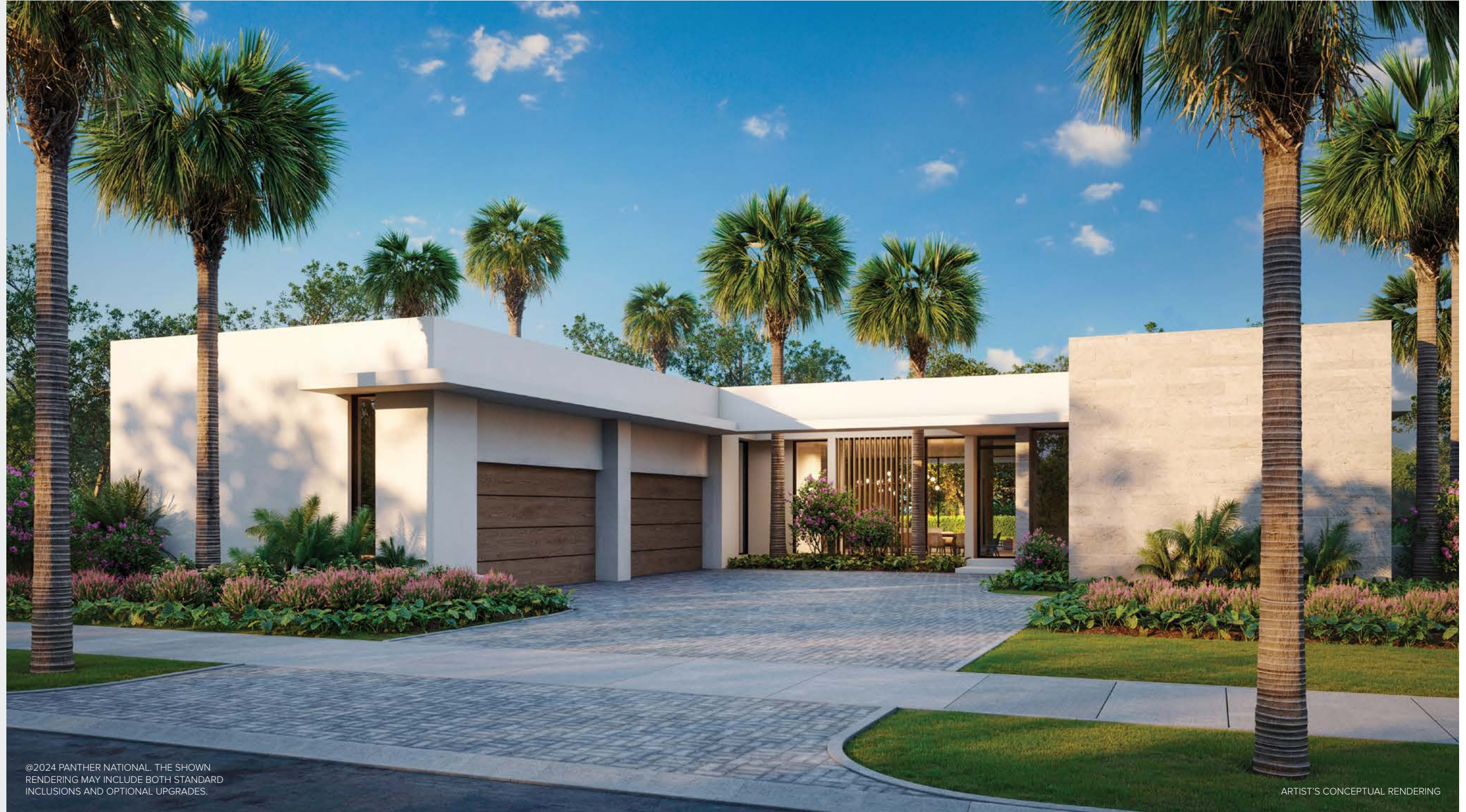
@2024 PANTHER NATIONAL. THE SHOWN RENDERING MAY INCLUDE BOTH STANDARD INCLUSIONS AND OPTIONAL UPGRADES.